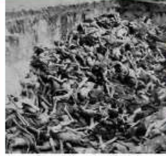
Corpses in mass graves at Auschwitz

UT. 28:33 t you do not know will and and labor produce, have nothing but cruel on all your days.